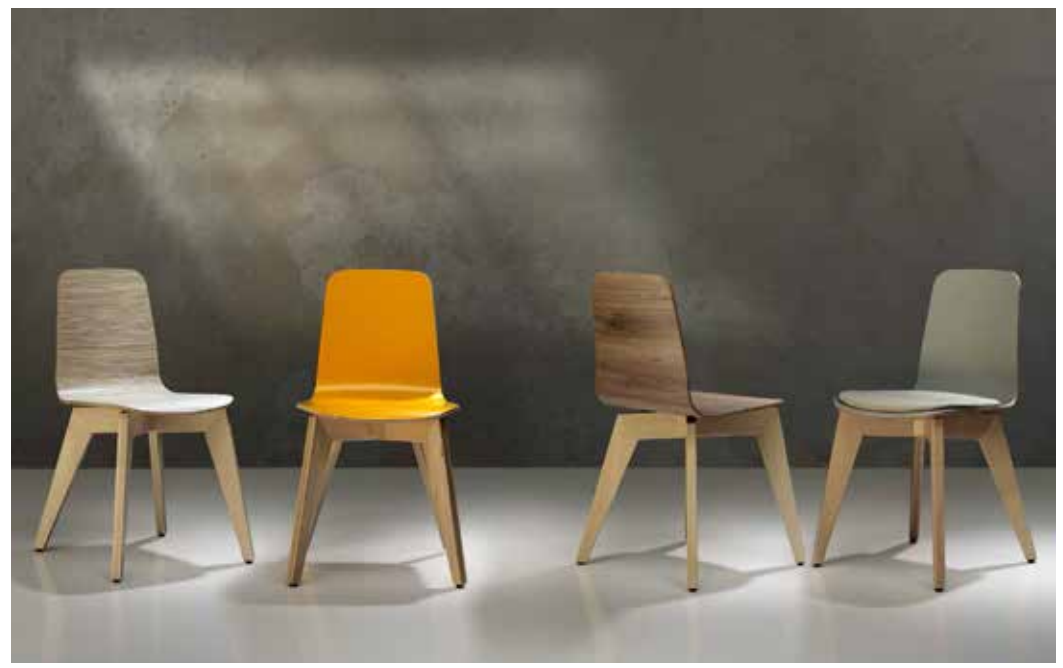
8071 INNA Natural beech frame, laminate shell.