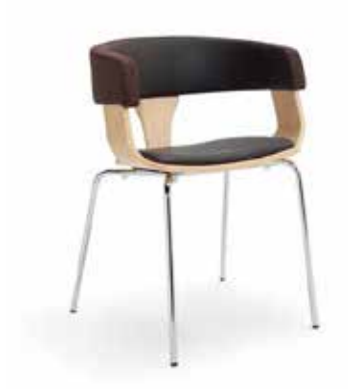
914 MALI Chair with metal legs, beechwood shell, padded with ecoleather / fabric.