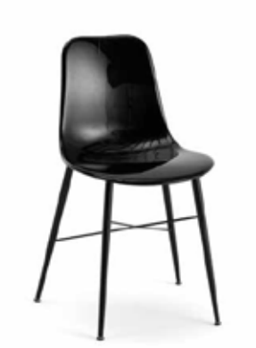
8073 INNA Metal frame with natural beech, plastic shell.