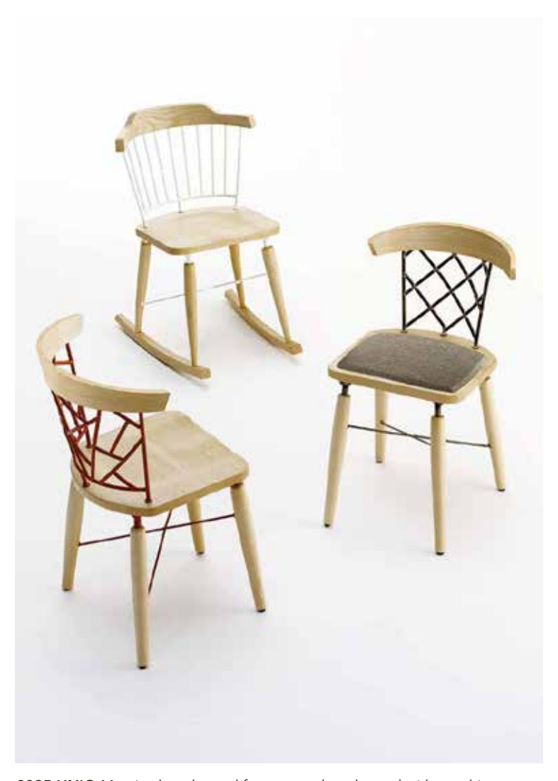
8095 UNIQ Massive beechwood frame, seat beechwood with coushion.8084 UNIQ Massive beechwood frame, seat massive beechwood.8090 UNIQ Massive beechwood frame, seat massive beechwood.