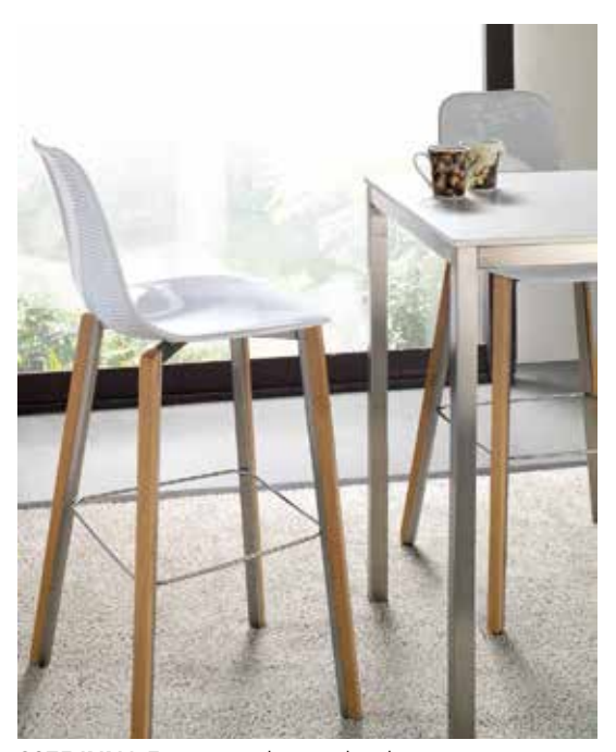
\bf 8075\ INNA Frame stainles steel with massive oak, plastic shell.