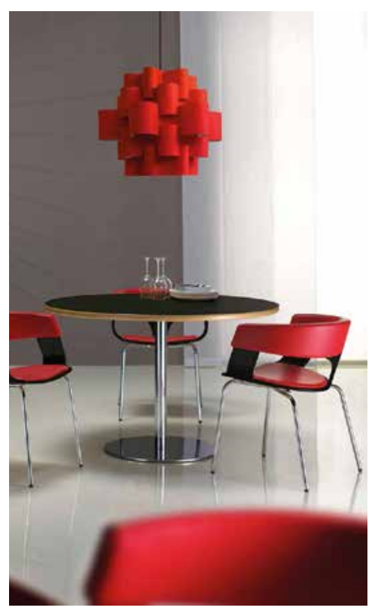
912 MALI Becchwood stained wenge shell, padded with leather.