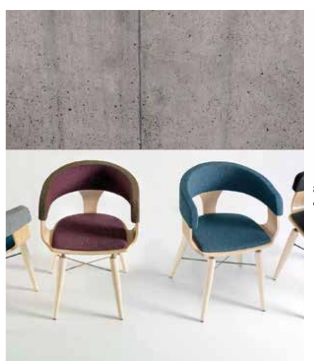
8041 MALI Massive ash frame, beechwood shell, padded with fabric/ ecoleather.