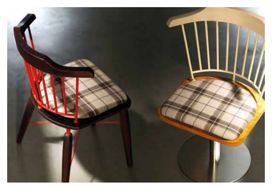
8080 UNIQ Frame beech stained wenge, seat beech stained wenge with coushion.8083 UNIQ Stainless steel swivel base, beech stained walnut seat with cushion.