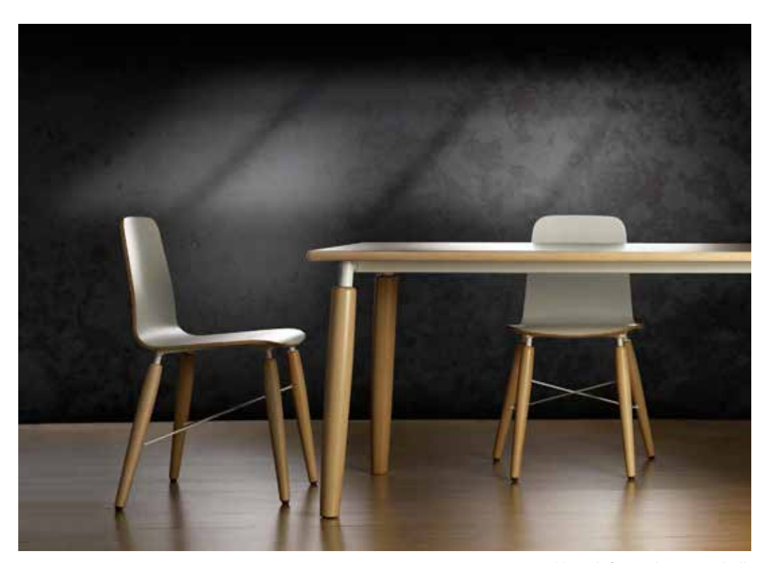
8070 INNA Natural beech frame, laminate shell.