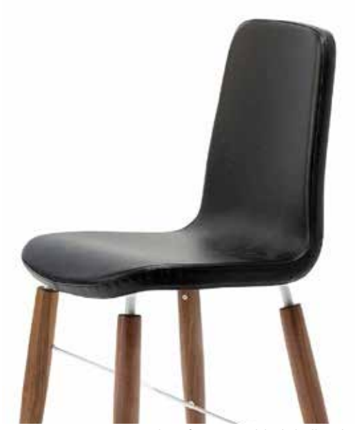
8070 INNA Massive walnut frame, padded shell with ecoleather.