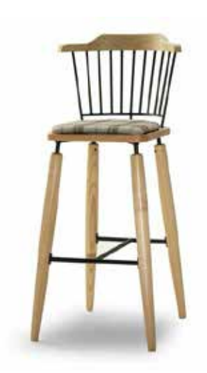
8085 UNIQ h82 cm massive ashwood frame, seat ashwood with coushion.