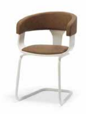
917 MALI Lacquered shell, padded with ecoleather.