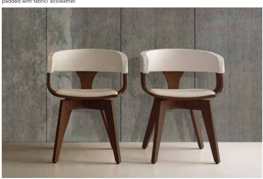
8040 MALI Massive beechwood stained walnut frame, beechwood stained walnut shell, padded with leather.