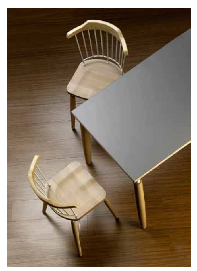
8080 UNIQ Massive beechwood frame, seat massive beechwood. 495 TAVOLO Frame beechwood, laminate top.