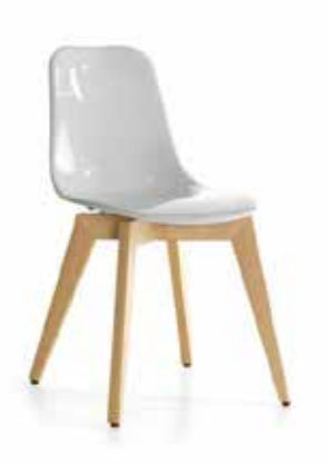
8071 INNA Massive bechwood frame, plastic shell.