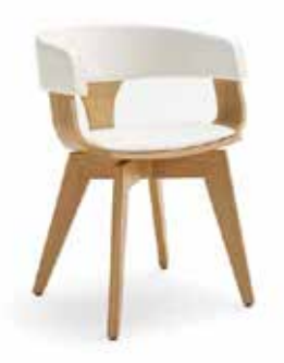
8040 MALI Massive oak frame, oak shell padded with leather.