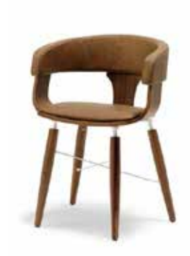
8041 MALI Massive walnut frame, walnut shell, padded with ecoleather.