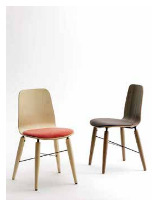
8070 INNA Massive maple frame, maple shell, seat with cushion.