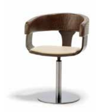
912 MALI Stainless steel, swivel base, walnut shell, padded leather with crocodile stamp.