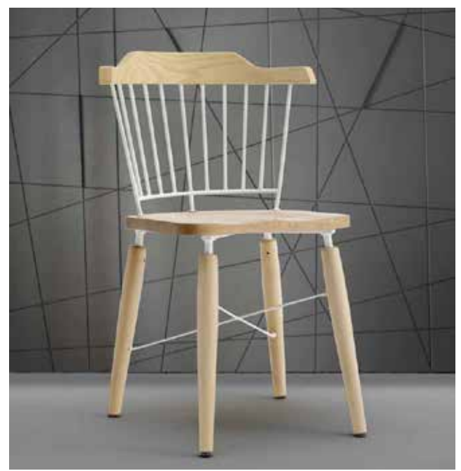
8080 UNIQ Massive beechwood frame, seat massive beechwood.