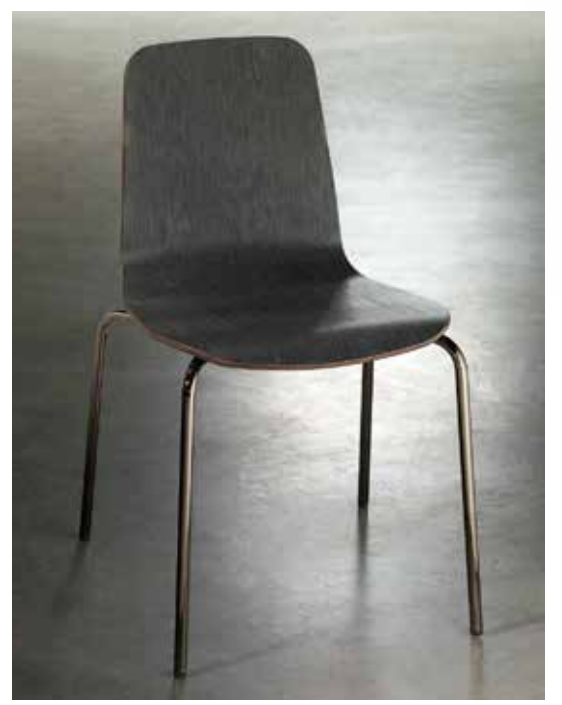
8074 INNA Titanium chrome frame, shell in zebrano / aluminum.