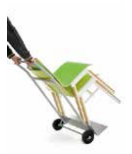
396 Trolley for chairs "Diablo model", with lever system.