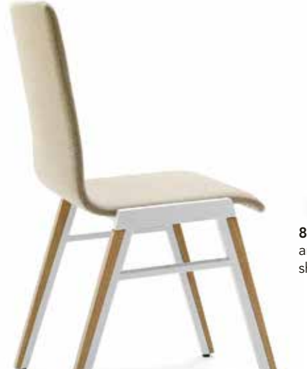
8060 FLEX DE LUX Oak and metal frame, padded shell, thickness 4 cm.