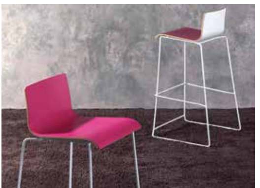
611 FLEX COLLECTION Swivel stainless steel frame, laminate shell, swivel.