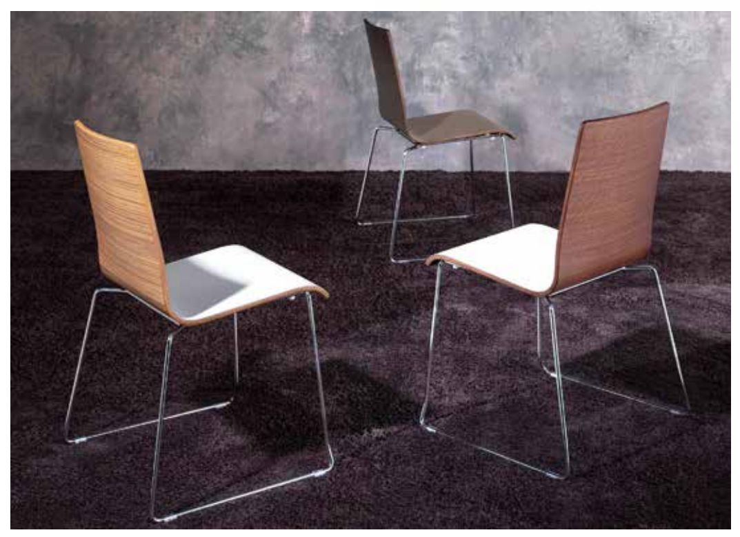
620 FLEX COLLECTION Beech shell, stackables.

620 FLEX COLLECTION Beech stained wengé shell with union system and cushion.