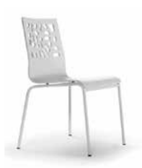
624 FLEX COLLECTION Shell lacquered with serigraphy.