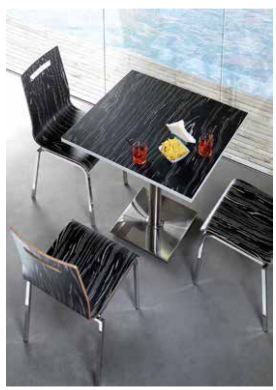
620 FLEX COLLECTION Black zebra wood shell. 468 TAVOLO Top with black zebra wood.