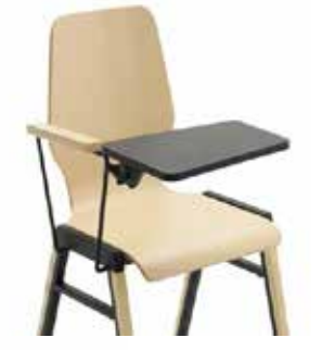
8060 FLEX DE LUX Ash and metal frame and armrest with writing tablet.

8060 FLEX DE LUX Oak and metal frame, padded shell, thickness 2 cm.