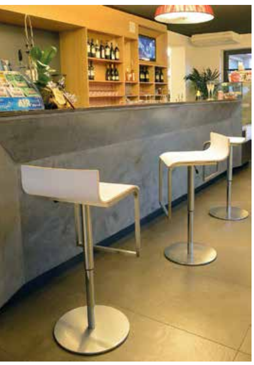
612 FLEX COLLECTION Adjustable height with gas system, laminate shell.