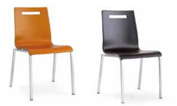
620 FLEX COLLECTION Leather sewn on wood shell and hole on the back.