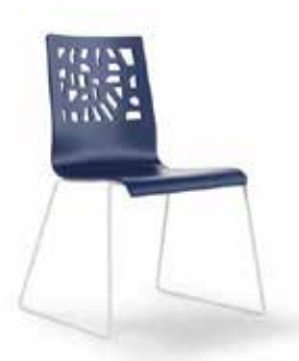
628 FLEX COLLECTION Shell lacquered with serigraphy.