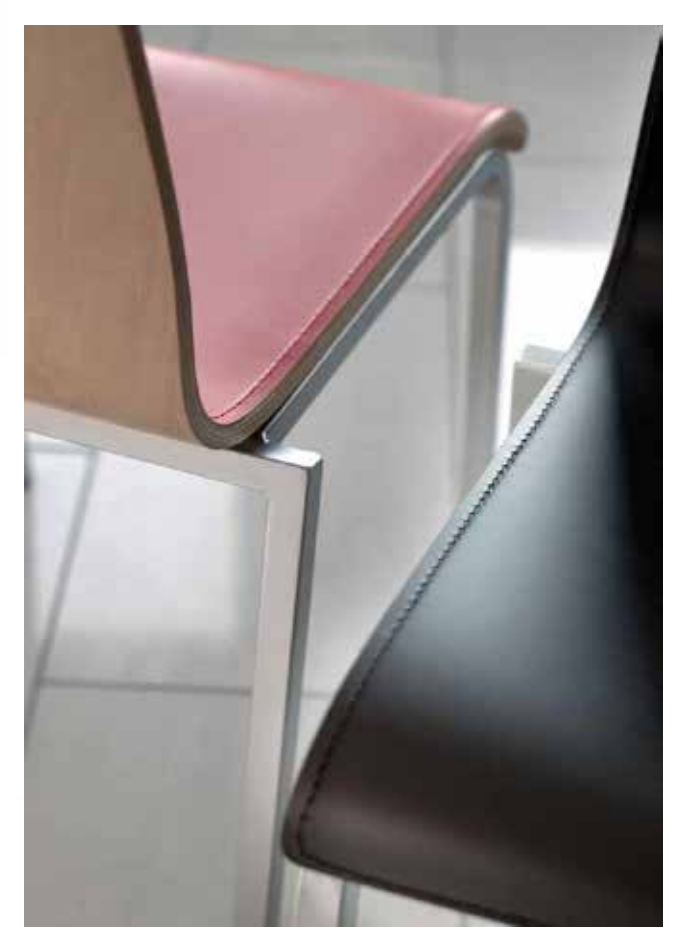
620 FLEX COLLECTION Regenerated leather sewn on wood.