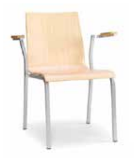
620 FLEX COLLECTION Oak shell with armrests.