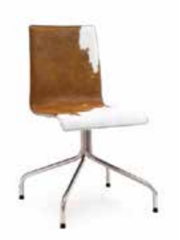
623 FLEX COLLECTION White and brown cow upholstered shell.