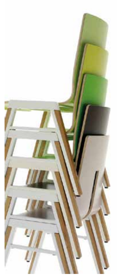
8060 FLEX DE LUX Oak and metal frame, laminate shell with serigraphy.