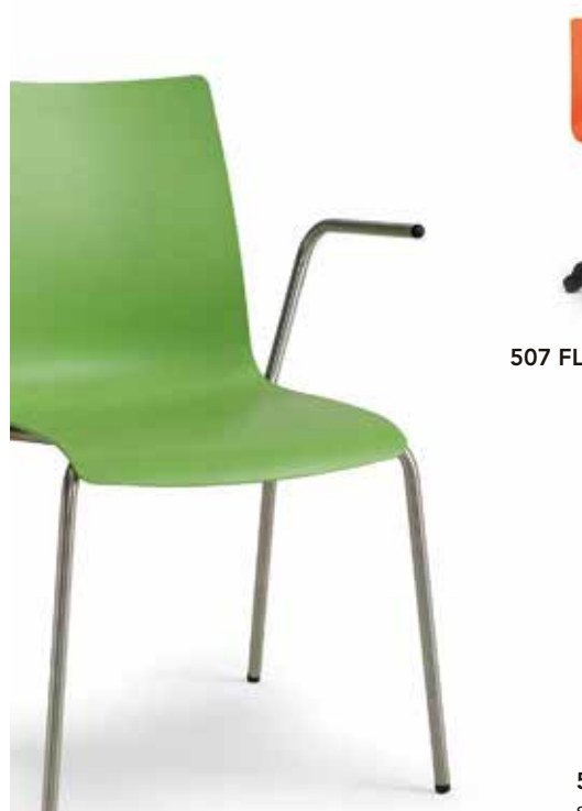
500 FLEX MIX Plastic shell with armrest.