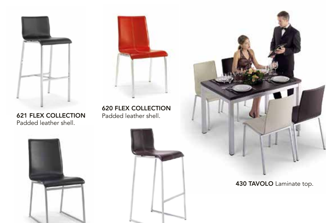
629 FLEX COLLECTION Padded leather shell.