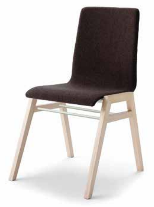
8061 FLEX DE LUX Beech frame, padded shell, thickness 2 cm.