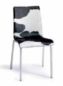
620 FLEX COLLECTION White and black cow upholstered shell.