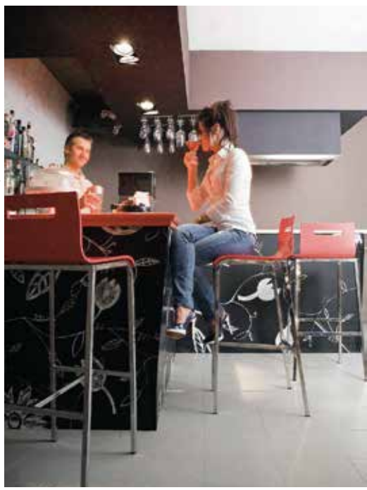
621 FLEX COLLECTION Laquered shell.