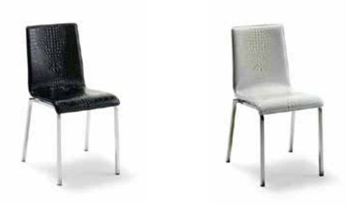
620 FLEX COLLECTION Padded leather shell with crocodile stamp.